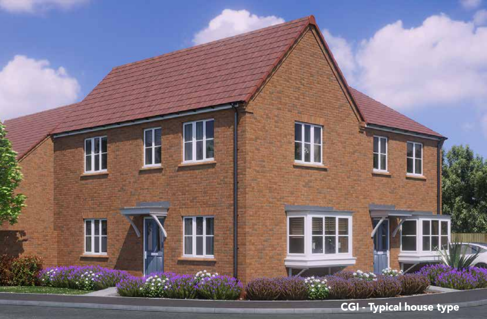
CGI - Typical house type