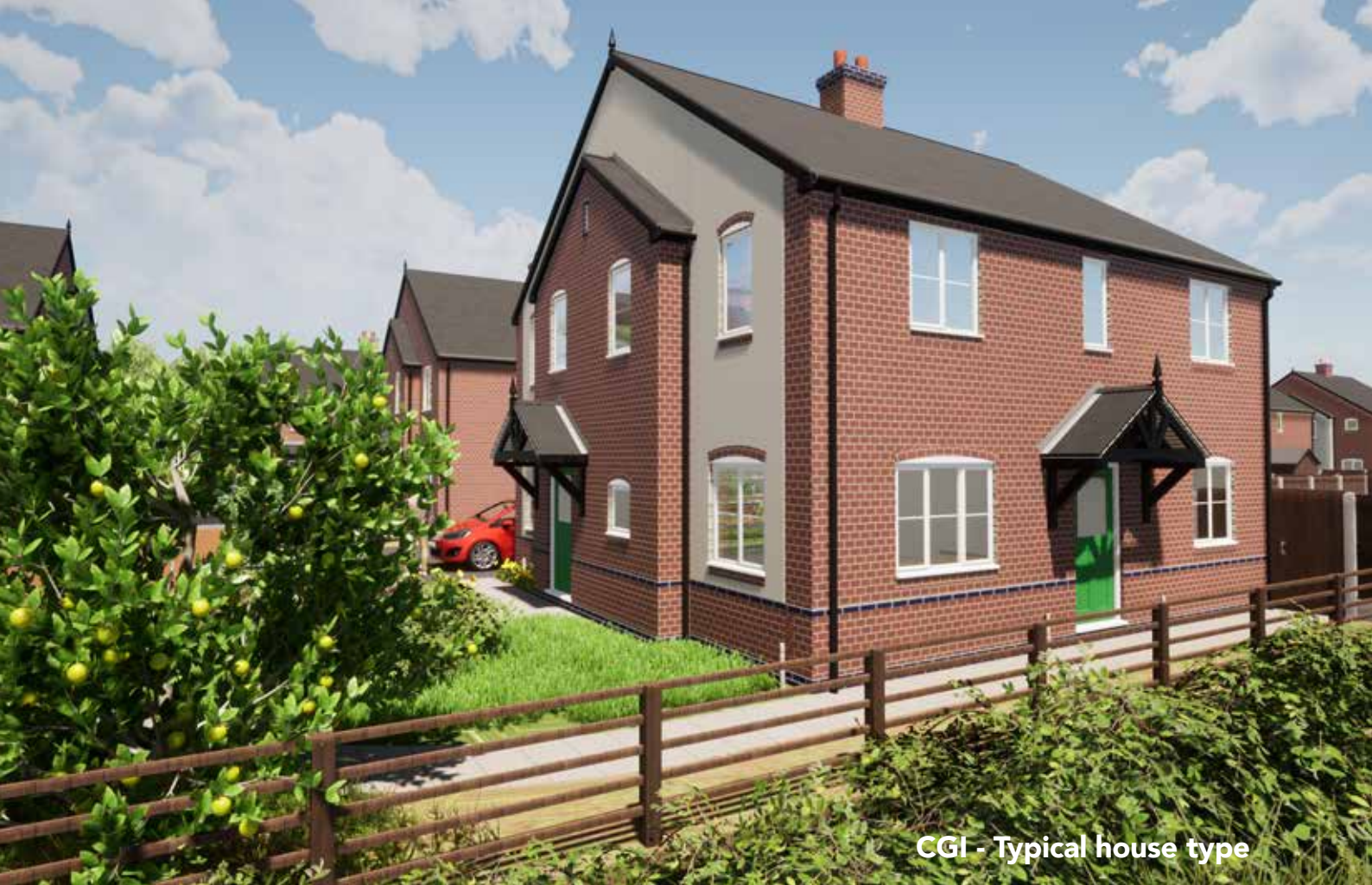
CGI - Typical house type