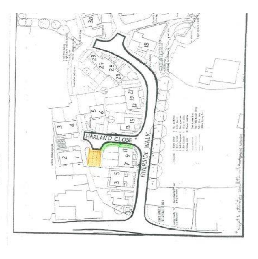
ASPAD 67 LEIL 3SE